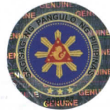
RODRIGO ROA DUTERTE President of the Philippines